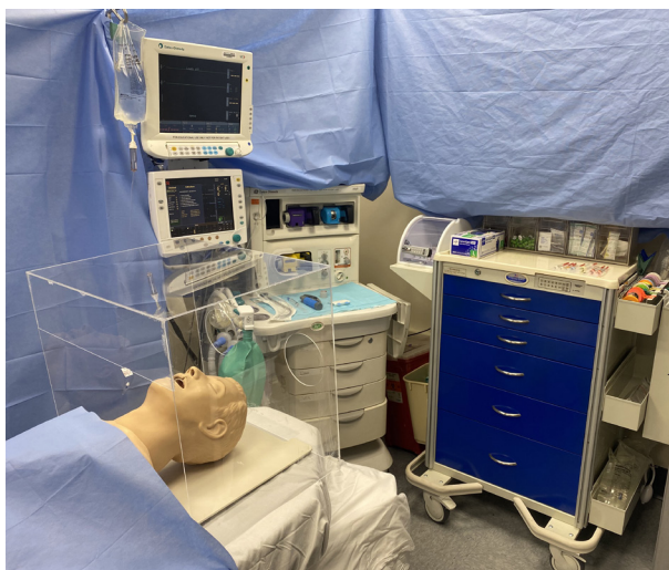
Fig. 2. Image of simulated operating room with aerosol box in position.

Finally, subjects were then instructed to clean the aerosol box in