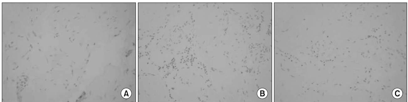
Fig. 2. Immunohistochemical in situ TUNEL detection of apoptosis in corporal tissue of the control (A), diabetes (B), and diabetes treated with C3G (C) groups. Cells undergoing apoptosis, called apoptotic bodies, show as black or dark brown in the TUNEL assay, while living cells are shown as lighter dots. ×400.

in muscle/collagen ratio was shown in the DM group compared with control group, C3G treatment significantly increased muscle/collagen ratio.