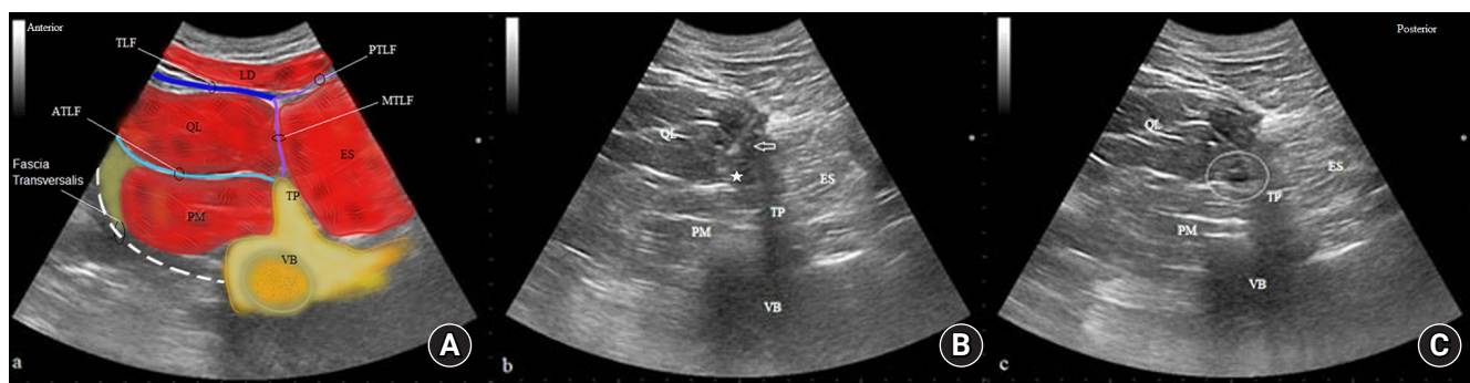
Fig. 2. Anterior quadratus lumborum block. A. (A) Convex ultrasound probe was placed on the iliac crest and in the transverse position to the posterior axillary line. Subsequently, the L4 vertebral body at the L4 vertebra level, along with the L4 transverse process, the quadratus lumborum, the erector spinae, and the psoas muscle, were identified as the Shamrock sign. (B) 21 G (100 mm) peripheral nerve block needle was directed towards the thoracolumbar fascia—from the posterior aspect of the transducer to the posteromedial anterolateral direction between the psoas muscle and the quadratus lumborum muscle. (C) Local anesthetic was injected after confirming the site by hydrodissection.

In addition to the descriptive statistical techniques (frequency,