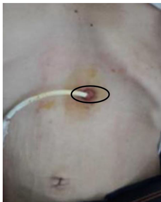
Fig. 1. Patient's gastrostomy site. Black oval: The patient's initial painful area.

Subsequently, the patient's dysphagia symptoms improved and the PEG tube was removed in May 2018. However, the patient continued to experience persistent abdominal wall pain near the