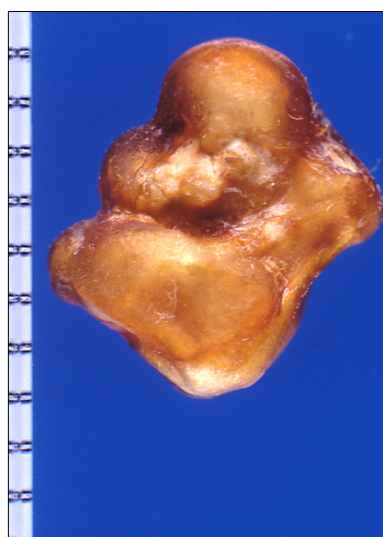
FIG. 2. An 11 g, bizarre-shaped, brown scrotal calculus.

malodorous hydrocele fluid between the tunica vaginalis testis visceralis and parietalis, an 11 g bizarre-shaped, brown stone without attachment to the tunica vaginalis was found (Fig. 2). Infrared spectroscopy revealed 100% carbonate apatite. A histological examination of the hydrocele wall was not accomplished. There were no known abnormalities in calcium, phosphorus, or parathormone metabolism. Postoperative follow-up was uneventful (Fig. 2).