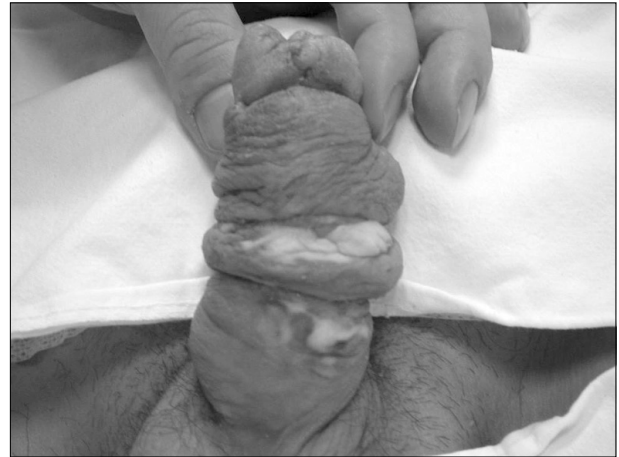
Fig. 2. Postoperative gross findings. The entire polyps are removed from the penis.