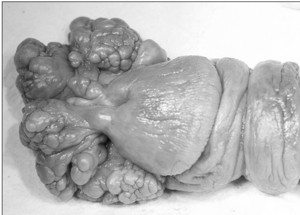
Fig. 1. Gross findings. A giant fibroepithelial polyp is observed at the ventral side of the glans penis.

Fibroepithelial polyps are a benign mesodermal neoplasms that include fibromas, leiomyomas, neurofibromas, and hemangiomas. 4 They tend to occur mostly on the skin, but can be found in a wide variety of sites to include the anus, urinary tract, and male and female genitals. Most fibroepithelial polyps in the urinary tract occur in the ureter and renal pelvis and rarely occur in the posterior urethra or bladder. 2 However, fibroepithelial polyps of the glans penis differ from those involving the urinary tract with regard to their pathogenesis, shape, size, and histologic features. Since fibroepithelial polyps