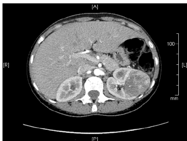
FIG. 1. Computed tomography (CT) scan showing a 3.4-cm×8.6-cm tumor in the middle pole of the left kidney with medullar development heterogeneously enhanced by the contrast agent.

Final pathological examination showed a 60-mm well-defined medio-renal tumor with a brownish-red appearance. The 11 removed lymph nodes were negative. Microscopically, the tumor showed biphasic growth patterns consisting of nests of eosinophilic and clear cells (Fig. 2). Immunohistochemical analysis was performed, using a panel of antibodies including CD10, RCC marker, vimentin, \alpha -methylacyl-coenzyme A racemase (p504s), human melanoma black 45 (HMB45), microphthalmia transcription factor (Mitf), TFE3, and TFEB. The tumor cells revealed diffuse nuclear TFEB staining, demonstrating a translocation RCC t(6;11)(p21;q12). They were also positive for vimentin, p504s, and HMB45 but in less than 10% of tumor cells. This tumor was classified as stage pT1bN0M0 Fuhrman grade 2.