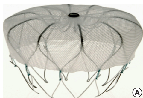
Watchman device