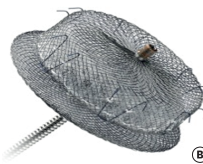
ACP device