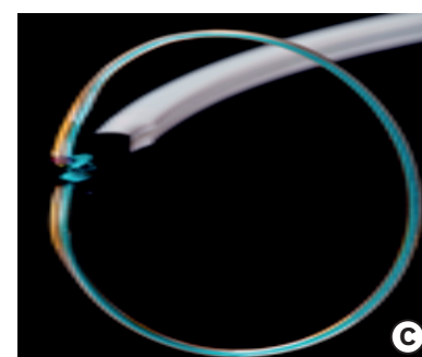
Lariat device