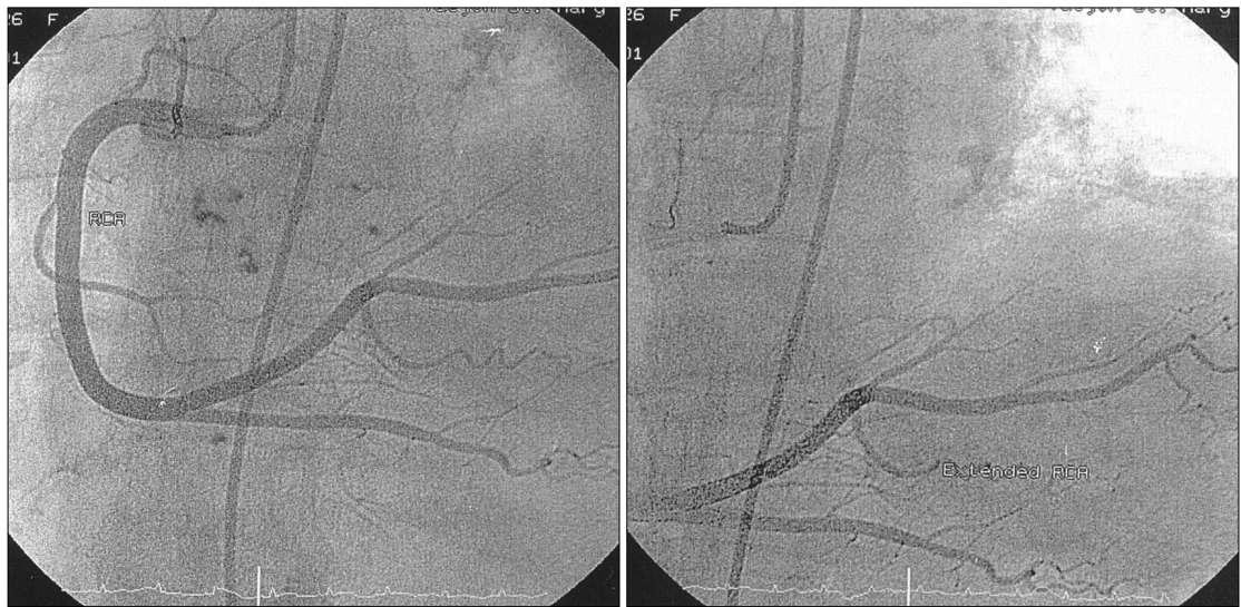
Fig. 2. Selective right coronary angiogram showed left circumflex artery arising as a terminal extension of right coronary artery in the anteroposterior view.

가 , 0.2 2% 1-4) , Gentzler 300 1 가 6) (Fig. 1). 가 drome) 19 (systolic click syn - 가 89% 가 (Fig. 2). , 가 7) 76% 고 안 1933 Antopol 5) 가 1-4) 60% 1-2) Vasalva 가 가