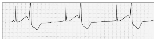
Fig. 3. Bigeminy of premature ventricular beats.

QT (820msec), Torsade de pointes(TdP)가 가 TdP가 QT 620msec (Fig. 2). 가 40 (bigeminy of premature ventricular beats)(Fig. 3) 2 4 (salvos of 2 to 4 consecutive beats)(Fig. 4) 2 가 11).