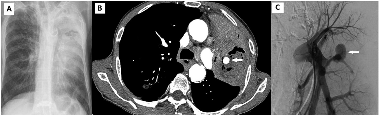
Fig. 2. An 82-year-old man with lung cancer complained of hemoptysis for 3 days. (A) Chest X-ray showing dense a consolidative lesion in the left upper lobe with an air-space lesion. (B) Enhanced chest CT scan showing diffuse consolidation and necrotic change in the left upper lobe and formation of Rasmussen's aneurysm in the necrotic and consolidative lesion. (C) The angiographic finding was a large aneurysm in the left pulmonary artery branch.