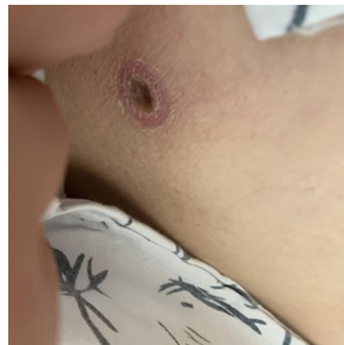
Fig. 1. Clinical photograph showing an eschar on the patient's anterior chest.