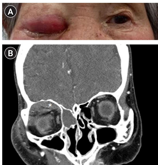
Fig. 2. Initial clinical presentation. (A) Preoperative photograph showing right periorbital swelling and erythema. (B) Computed tomography scan illustrating a subperiosteal abscess (indicated by an asterisk). The patient provided written informed consent for the publication and use of images.

respiratory tract infection symptoms including cough, rhinorrhea or sputum (n=5) and toothache (n=2). The most common diagnoses were orbital cellulitis (n=8, 44.4%) (Fig. 3B), followed by preseptal cellulitis (n=5, 27.8%) (Fig. 3A), and subperiosteal abscess (n=5, 27.8%) (Fig. 3C). On initial ophthalmology examination, four patients (22.2%) had diplopia, and one (5.6%) had reduced visual acuity.