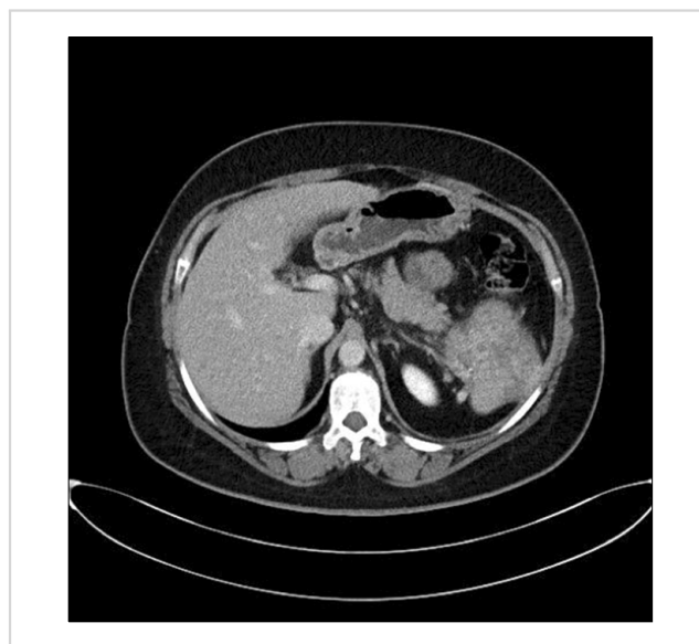
Fig. 4. Abdominal CT showing reduced size of the spleen after ERT (2021).

recognizing nonspecific symptoms due to low awareness and the perception that GD is too rare to be seen at the hemato-oncology clinic.