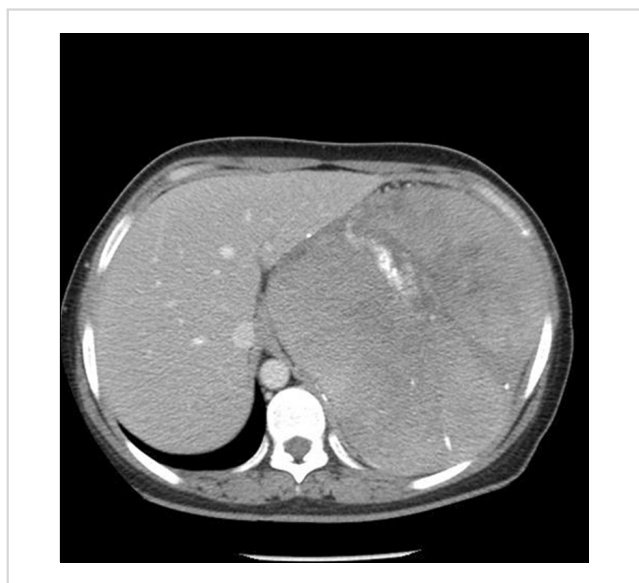
Fig. 3. Abdominal CT showing huge splenomegaly before enzyme replacement therapy (2017).