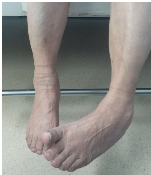
Fig. 1. Inversion of left ankle in case 1 patient.

One week after the injection, a follow-up electromyography showed decreased dystonic muscle contractions. Follow-up physical examinations revealed 40° in the abduction angle of the left hip joint, decreased frequency and duration of the involuntary movement. Stretching exercise was continued in order to reduce muscle tone in left ankle and hip muscles. Afterwards, she