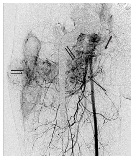
Fig. 2. Arteriovenous malformation of the right thigh. Right common femoral angiogram shows feeding arteries (long arrow), a dense nidus of malformation (double arrows) in the thigh, and early opacification of draining veins (thick arrow).

hematoma and for the planning of aspiration if required. Ultrasonography revealed a heterogenous low echogenic mass with acoustic enhancement at the subcutaneous layer above the fascia of the right vastus lateralis muscle, suggestive of a lesion with cystic contents (Fig. 1-A). However, pulsatile arterial stalk flow was observed between the inner cyst and the vastus lateralis in power and simple Doppler modes (Fig. 1-B, C). Angiography was performed on both femoral arteries to identify any vascular malformation, and blood supply into the mass was observed from the right internal iliac artery and deep femoral artery. In addition, enhanced nidus, early