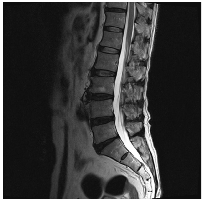
Fig. 1. Lumbar T2 weighted image. Taken when pain in his right hip and numbness in the back of his thigh appeared. There are no specific findings except degenerative changes.

The patient's symptoms worsened while waiting for the neurology outpatient appointment date, and three days after returning home from the emergency room, he complained of tingling sensations all over his skin below the navel, significant weakness in his lower extremities, and difficulty passing stool and urine. On physical examination, dorsiflexion and plantarflexion were grade 4, and in the lower extremity, muscle strength and sensations were dull below the T10 dermatome, the deep tendon reflex was normal, and pathological reflexes such as Babinski reflex and Hoffman reflex were not observed. The neurologist suspected acute transverse myelitis, a common side effect of the vaccine, and