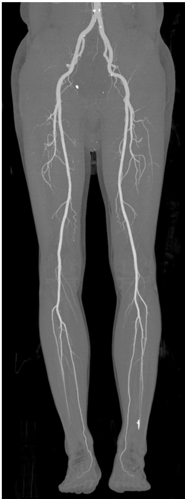
Fig. 2. Lower extremity computed tomography angiogram. Taken at emergency room visit with sudden loss of sensation and paralysis in the entire right leg and electricity-like pain. There are no findings suggestive of arterial occlusion, such as thromboembolism.

ordered a whole-spine MRI with gadolinium contrast, an electromyography (EMG), and a cerebrospinal fluid (CSF) study. Steroid pulse therapy (intravenous methylprednisolone 1 g per day) was started while the patient was in the hospital. However, after 2 days of steroid pulse therapy, the patient's symptoms worsened rather than improved.