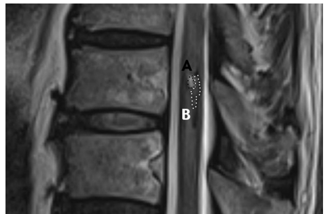
Fig. 4. Two layers of hemosiderin deposition. Hyperintense lesions with different intensities are shown as two layers, with a black dotted line A and a white dotted line B.

Morton's neuroma is a type of degenerative neuropathy of the interdigital nerve. It is common among middle-aged female, with a lifetime prevalence of 50.2% for men and 87.2% for female [7]. Piriformis syndrome is myofascial referred pain of the piriformis muscle, a pyramid-shaped muscle attached to the upper part of the greater trochanter in the anterior capsule, caused by compression of nerve blood vessels in the great sciatic foramen due to piriformis muscle contraction or thickening. It can cause pain and discomfort during defecation [8]. The patient in this case also showed clinical features of Morton's neuroma or piriformis syndrome, which are mainly seen in pain clinics, manifesting symptoms such as paresthesia between the toes, pain, and paresthesia in the buttocks, and discomfort during defecation. However, no lesions were discovered during radiological examination and physical examinations that are routinely performed at the pain clinic. Furthermore, physical and drug treatment following the presumptive diagnosis was ineffective, and the symptoms worsened rapidly. Given this,