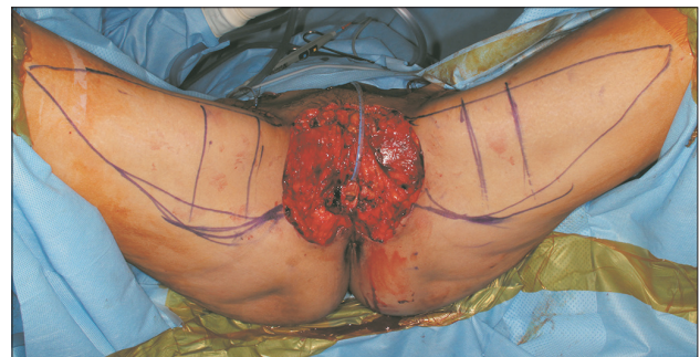
Fig. 1. Both sides of the vulvar defect; preparation of the medial thigh V-Y advancement flap.

For the left vulva defect, suprafascial dissection was done from the proximal thigh to the distal over the gracilis muscle, and a proper size of perforator was found, specifically the anterior obturator artery perforator. The