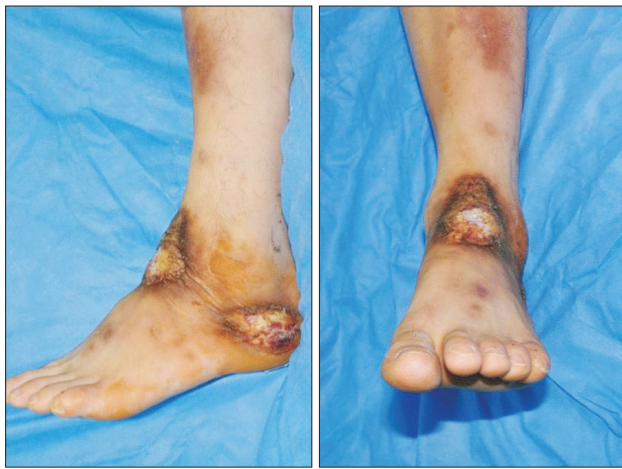
Fig. 1. Preoperative image of the ulcerative masses on both the ankle and heel.

A 45-year-old male patient presented with a growth over the shin of the left foot that had been growing in size over the past three years accompanied by pain for the past month. Past history revealed that he was a smoker and an alcoholic for the past 20 years. He had diabetes mellitus and hypertension. The patient had chronic venous insufficiency and ulcerations on the lower legs. There was a tender caulicle over an ulcero-proliferative-like growth with