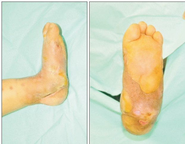
Fig. 5. After 1 year follow-up of anterolateral thigh free flap operation.

lower extremity reconstruction is to recover and maintain function wherein skeletal reconstruction with stable soft-tissue coverage is essential. In this aspect, ALT free flap can be a good option. Because the patient was diabetic, he was not an ideal candidate for vessel, but anastomosis of one artery and two veins was done. We used the posterior tibial artery for arterial anastomosis, and the flap size was 7.0 \times 15.0 cm. Post-operatively, discharge was noted from the operative site due to osteomyelitis, but all the flaps survived well with dressing (Fig. 5). Furthermore, no notable complications were seen at the donor site of the flap and vessel, which suggests a successful healing