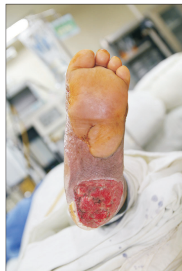
Fig. 3. Recurrence of verrucous carcinoma on the heel.