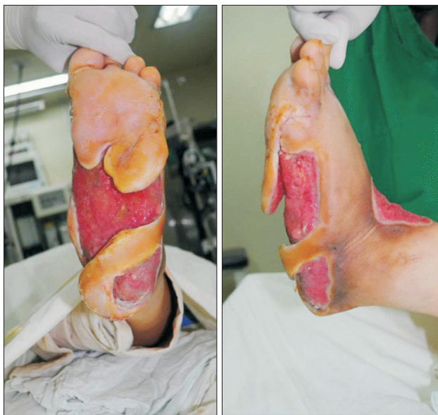
Fig. 2. After wide excision of the mass on the left foot and debridement.