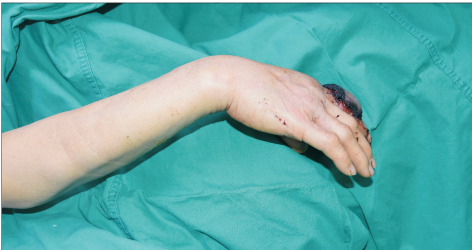
Fig. 2. After a prolonged free flap surgery of 19 hours, during which a tourniquet was inflated for less than two hours, wrist-drop and loss of finger extension accompanied by sensory change appeared in a 45-year-old woman (Case 2).