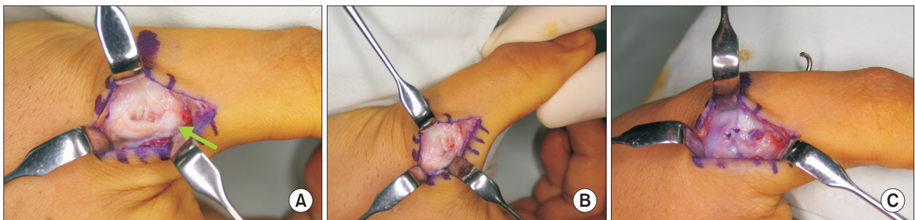
Fig. 1. (A) Distal ulnar collateral ligament (UCL) ruptured site is thin and changed into a translucent granulation tissue (arrow). (B) Detachment site is well observed with over-pronation of the thumb. (C) UCL was reattached with an absorbable suture anchor and the joint capsule was repaired.

The average of time interval from injury to operation of group A (86 weeks) was larger than that of group B (14 weeks). Between the 2 groups, there was no significant difference ( p > 0.05 ) in average age, postoperative flexion contracture, further flexion, ROM of the MP joint, verbal pain scores, postoperative grip strength ratio (grip