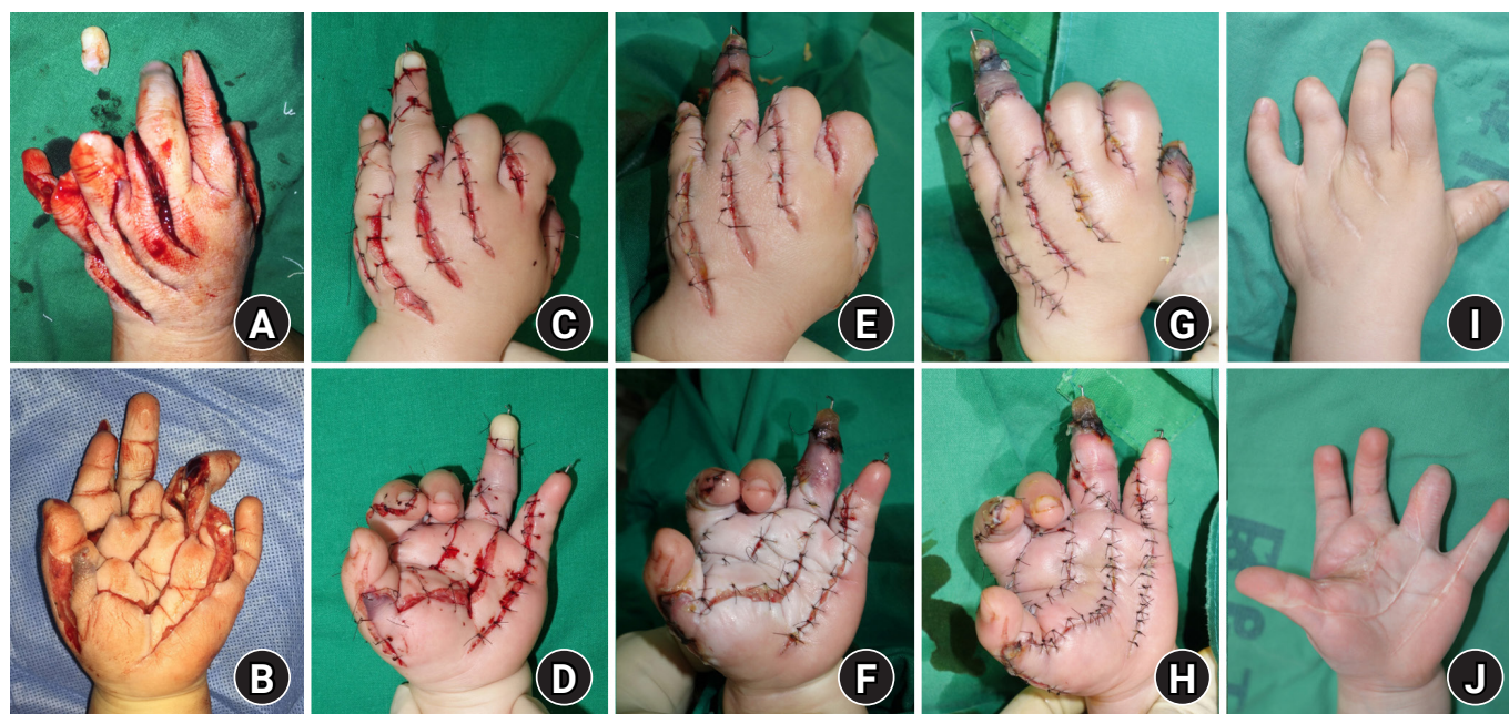
Fig. 1. (A, B) A 22-month-old female patient injured her left hand, particularly on the index finger to the little finger, in a mushroom shredding machine. (C, D) During the initial reconstructive surgery, the wounds were approximated with loose sutures, and the degree of intensity of external compression was adjusted daily. We controlled severe postoperative swelling by tightening the loose skin sutures daily, starting from the 3rd (E, F) to the 8th (G, H) postoperative day. (I, J) Postoperative 4-year follow-up view after release of the first web space contracture with a full-thickness skin graft in the second postoperative year.

A 45-year-old female patient presented with a shredder injury on her left middle finger to her little finger by a raw fish shredder (Fig. 2). After thorough wound irrigation, only initial tissue alignment of the mutilated wound was performed rather than suture on the next day of injury because the patient was an adult and had a narrow shred width. Severe edema was observed in the shredded parts, but perfusion was not compromised. After 4 days of surgical delay, we attempted sutures for edema and shape control. However, indocyanine green (ICG) angiography confirmed that suture placement caused poor distal circulation, and restored circulation was observed immedi-