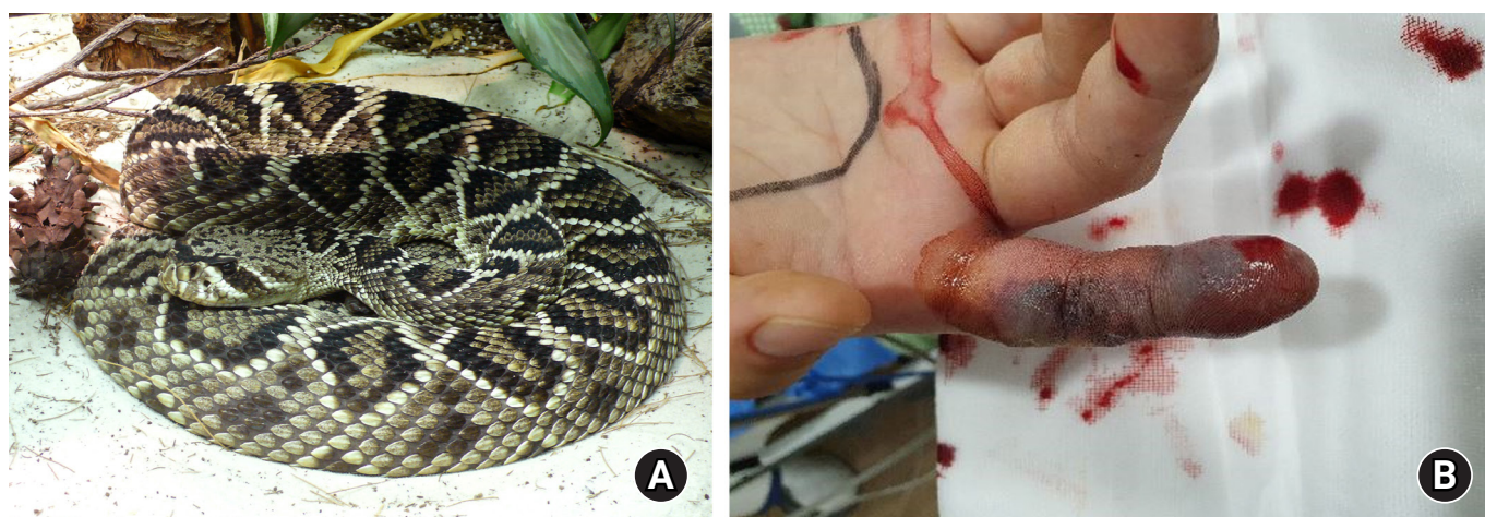
Fig. 1. (A) Rattlesnake ( Crotalus adamanteus ). (B) Initial presentation of the patient. The digit had a dusky appearance in 12 hours after injury.

There are four species of venomous snakes that exist in Korea: three species in Gloydius genus ( Gloydius blomhoffii , Gloydius saxatilis , Gloydius ussuriensis ), and one species in Rhabdophis genus ( Rhabdophis tigrinus ) [1]. The venom from these snakes is usually not toxic and systemic derangement from the response to the injected toxin is rare. In contrast to reports from Southeast Asian countries, where 70% of injuries are to the lower extremity, the percentage of upper extremity injuries is 69.6% in Korea. However, rattlesnakes are the most common cause of snakebite in the United States, and the mortality rate is higher compared to other snakebites [2]. The rattlesnake's venom, consisting of a mixture of over 50 different proteins, cause local, hematologic, neurologic, and systemic effects. Because each component affects multiple organ systems, it is hard to