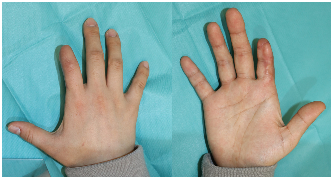
Fig. 4. Postoperative 2 months finding. The wound was totally healed.

talidae polyvalent immune fab (CroFab; BTG, London, UK) is purified ovine-derived immunoglobulin for four snakes (western diamondback, eastern diamondback, Mojave rattlesnake, and cottonmouth). Crotalidae Immune F(ab)2 (Anavip; Bioclon, Mexico City, Mexico) is equine-derived IG for two snakes ( Bothrops asper and Crotalus durissus ), usually not requiring repeat maintenance dosing due to the longer duration of activity [7]. Proper antivenom administration within 4 hours of envenomation offers a decreased risk of requiring surgical intervention. In many cases, however, patients could not identify the snake species that bit them. So, knowing the common snakes in the locality may help find the real culprits.