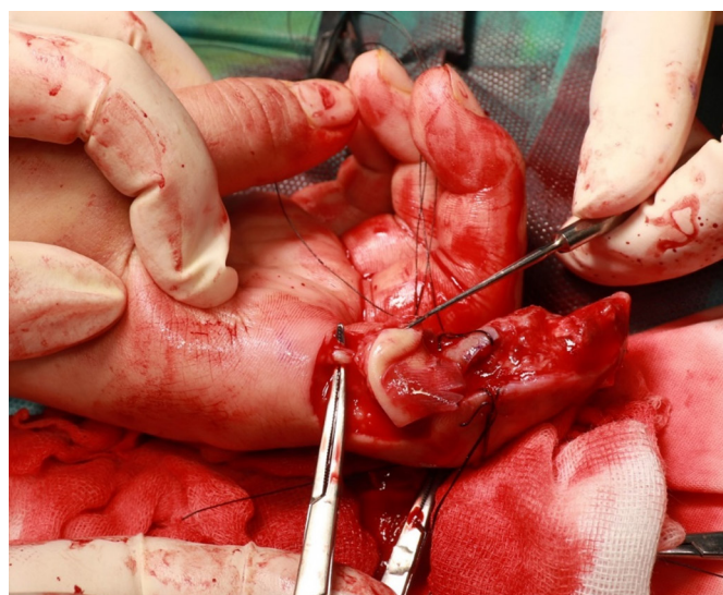
Fig. 3. Intraoperative finding. After the amputation of the middle phalanx head, the reverse homodigital artery-based island flap was performed for resurfacing with the identification of the pedicle.

rigidly classify them as tissue-toxic or neurotoxic. Two of the major components include phospholipase A2 toxin and metalloproteinases. Phospholipase A2 toxins are thought to have myotoxic, anticoagulant, and neurotoxic effects, by inhibiting neuromuscular transmission by blocking presynaptic calcium channels. They are also thought to damage platelet membranes, resulting in thrombocytopenia [6]. Metalloproteinases are supposed to be contributors to local tissue destruction and hemorrhage. They alter the morphology of endothelial cells of capillary vessel by cleaving peptide bonds of basement membrane, resulting in hemorrhage. Snakebites show common symptomatology including local tissue damage and systemic manifestations.