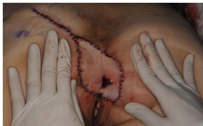
Fig. 3. Immediate postoperative photograph showing the anal mucosa sutured to the hole of the flap. Written informed consent for publication of their clinical images was obtained from the patient.