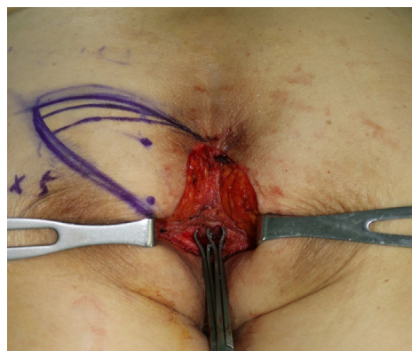
Fig. 2. Intraoperative design of the superior gluteal artery perforator flap from the left buttock based on three perforators. Written informed consent for publication of their clinical images was obtained from the patient.