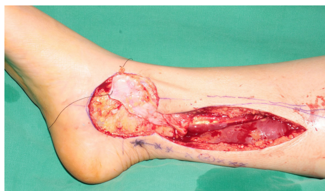
Fig. 3. After the flap was turned over to the defect, it was folded once into two layers for reinforcement, fixed on the exposed bone of the medial malleolus.