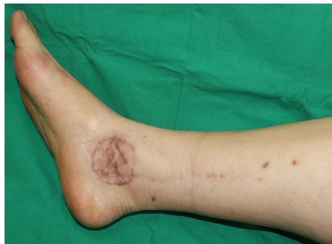
Fig. 5. Eleven months after the operation, it was confirmed that the surgical site was maintained stably.

In soft tissue reconstruction of the medial malleolar area, the thickness of the thin flap is a very important factor considering