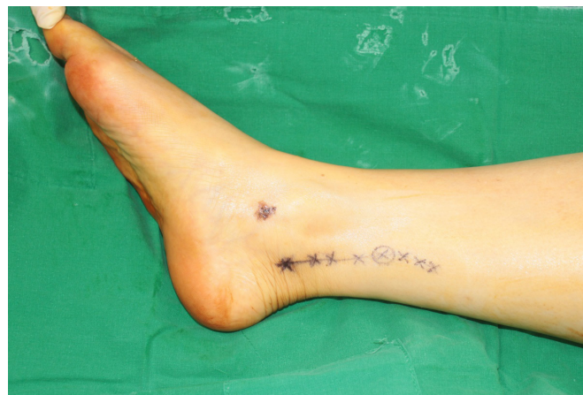
Fig. 1. A 0.8 cm×0.7 cm sized dark pigmented mole was noted on right ankle. Reconstruction using a posterior tibial artery-based perforator flap was planned. The running of the posterior tibial artery on the skin was marked as photo with Doppler.