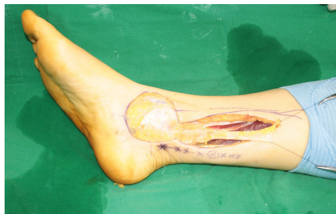
Fig. 2. After wide excision, a 2-cm proximal point from the medial malleolus was set as the pivot point, and the fascia was cut at the proximal 7 cm from the pivot point and then dissected toward the subfascial plane.