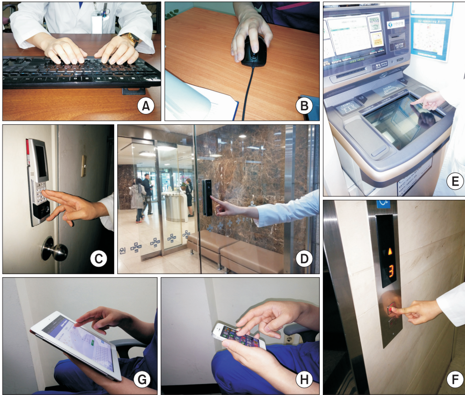
Fig. 3. Activities require the use of the ulnar compartment more so than before. (A) Typing keyboard needs sensation of ulnar compartment. (B) Also using a mouse needs sensation of ulnar compartment. (C) Button type lock, or (D) opening a door with a button also require ulnar compartment more than radial compartment. Many electronic devices and machines such as (E) automated teller machine or (F) elevator are controlled with fingers especially ulnar side of fingers. Recently, we use many (G) haptic devices and (H) smartphones which are mostly run by ulnar sides of fingers.

re-establishing the sensory dominant sides of fingers. Furthermore, these findings may be helpful in better donor site selection for the neurovascular island flap and also be helpful to select the nerves to be reconstructed preferentially when reattaching the fingers.