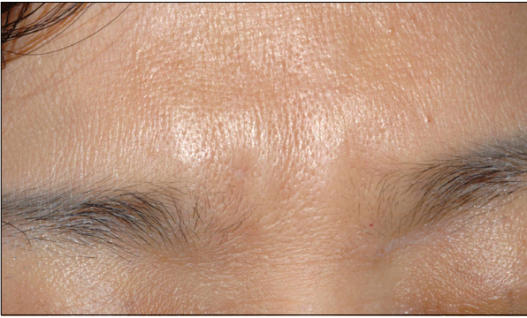
Fig. 3. After 3 months of treatment with oral doxycycline and intralesional triamcinolone acetonide injection, substantial improvement of the lesion was observed.

triamcinolone acetonide (5 mg/ml) with a 4-week interval, which resulted in flattening and softening of the lesion (Fig. 3).