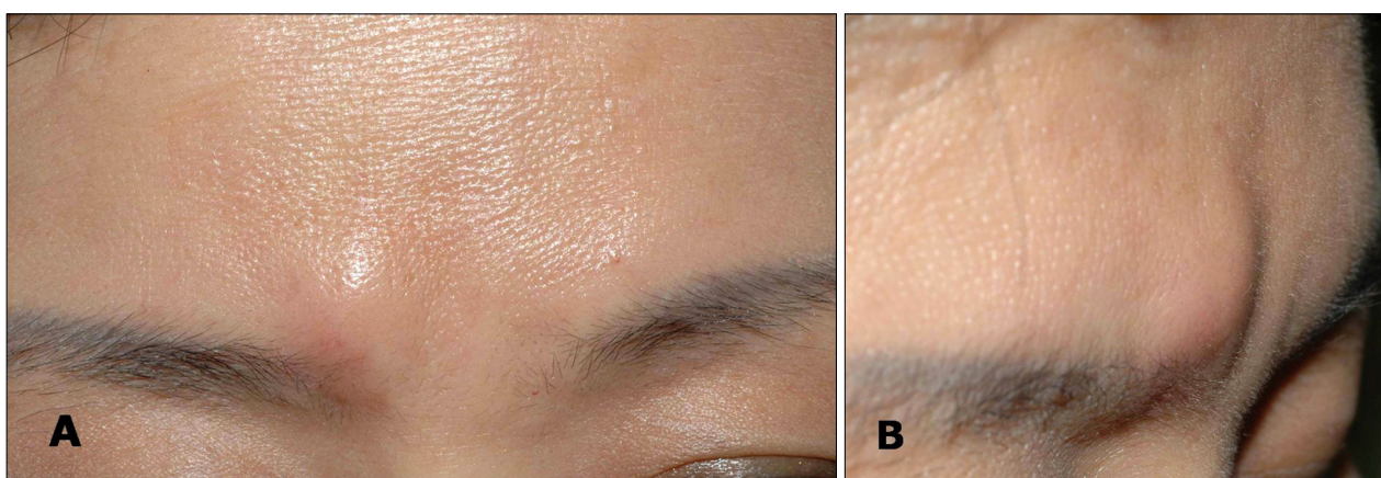
Fig. 1. (A) A solitary indurated erythematous nodule with a smooth surface in the right-side glabellar fold. (B) The lateral view of the lesion.

The patient was treated with oral doxycycline 100 mg twice a day for 8 weeks and then once a day for 4 weeks. She also received a total of three intralesional injections of