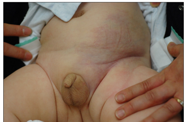
Fig. 3. Slightly bluish and erythematous induration of involuted lesion 3 months after treatment.

One month following skin biopsy, the lesion suddenly expanded to the abdomen and scrotum (Fig. 1B). Physical examination revealed a purpuric and firm induration covering the lower half of the left abdomen, pubis, scrotum and upper to medial thigh. The initial laboratory work-up revealed severe thrombocytopenia (platelet counts, 61,000/\text{mm}^3 ); increased D-dimer (15,335 ng/ml, reference range: 0~243 ng/ml); increased fibrin degradation products (1:8~16 positive, reference: 1:2 negative) and decreased fibrinogen (67 mg/dl, reference range: 200~400 mg/dl), suggestive of consumptive coagulopathy. Abdominal ultrasound imaging study revealed mild hepatomegaly. Other laboratory results including white blood cell counts, hemoglobin, bleeding time, coagulation time, prothrombin time (PT), antithrombin III, and activated partial thromboplastin time (aPTT) were within the normal range. He was diagnosed with KMS arising from a pre-existing tufted angioma based on the clinical findings and laboratory values. The patient was admitted to commence immediate treatment with intravenous