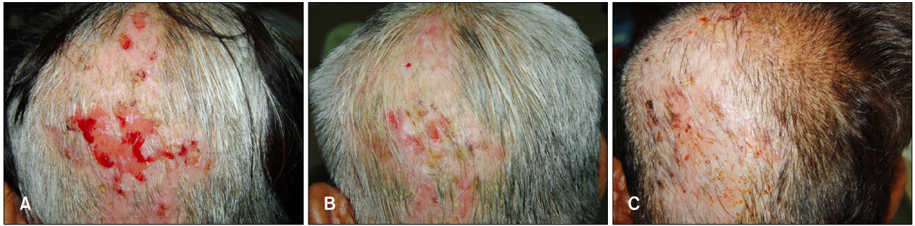
Fig. 1. (A) Erosions and crusted pustular lesions on the left occipital scalp. One week (B) and, 2 months (C) following treatment with topical tacrolimus.