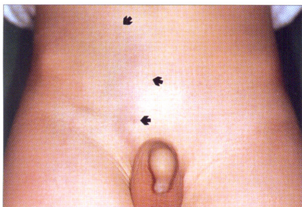
Fig. 1. Slightly depressed, huge, skin-colored patch with an erythematous to purplish border on the right lower abdomen and inguinal area.

infiltration (Fig. 2B). An immunohistochemical study by TUNEL stain was positive in the mononuclear cells around the degenerating subcutaneous fatty tissue. Staining of the erythematous edge area was stronger than the depressed area (Fig. 3A, B). On the basis of these clinical and histological findings, the diagnosis of centrifugal lipodystrophy was made. The patient was treated with a topical corticosteroid application for 3 months, but this was ineffective. Moreover, the erythematous border spreaded to the left abdominal wall, and the underlying vessels was seen more distinctly.