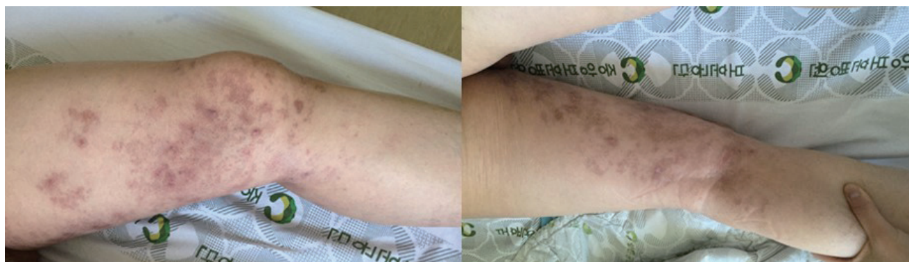
Fig. 1. The patient showed scars of herpetic eruption and pigmentation over the left medial anterior thigh and medial calf, but not over the lateral thigh.