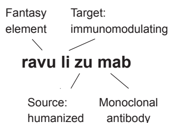
Fig. 1. Example name of a monoclonal antibody. Target substem: ‘-li(m)-’ for immunomodulating, ‘-tu-’ for tumor target, ‘-ne-’ for neural target, ‘-ci-’ for cardiovascular target; source substem: ‘-ximab’ for chimeric monoclonal antibody, ‘-zumab’ for humanized monoclonal antibody, ‘-umab’ for fully humanized antibody, ‘-mab’ without source designation for newer monoclonal antibodies.

Both inotersén (Tegsedi®; Ionis, Carlsbad, CA, USA) 16 and patisiran (Onpattro®; Alnylam, Cambridge, MA, USA) 17 inhibit