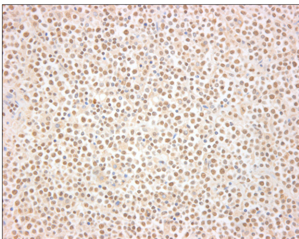
Fig. 2. When the T-cell lymphomas were evaluated, all of the cases were strongly positive for Smad3.

*acute lymphoblastic lymphoma, † peripheral T-cell lymphoma-unspecified, ‡ anaplastic large cell lymphoma, § angioimmunoblastic T-cell lymphoma, || adult T-cell lymphoma.