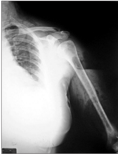
Fig. 1. A radiograph taken on the second day after trauma shows subcutaneous emphysema from the left arm to the ipsilateral shoulder, neck, and lateral chest wall.

0 to 0.5 mg/dL). At this time, follow-up radiography demonstrated subcutaneous emphysema from the left arm to the ipsilateral shoulder, neck, and lateral chest wall (Fig. 1). Gas gangrene was diagnosed and empirical, high-dose, broad-spectrum antibiotics (ceftriaxone, clindamycin, aminoglycoside) were intravenously administered after consultation with the department of infectious disease. The patient underwent emergency surgery within three hours after the clinical symptoms manifested.