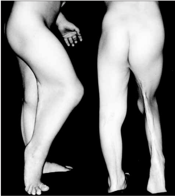
Fig. 1. Photographs showing the flexion contracture and web on the popliteal space of the right knee joint.

to the sciatic nerve. Thereafter, soft tissue lengthening was attempted in another hospital at the age of 5 because the flexion contracture and popliteal pterygium of the right knee relapsed, but the adhesion to the sciatic nerve also caused a failure. On the physical examination, 45° of knee