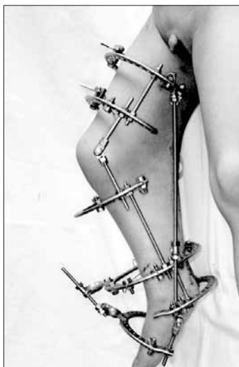
Fig. 2. Photographs showing the application of the Ilizarov external fixator.

PPS is a rare genetic condition that's characterized by popliteal webbing, craniofacial anomalies, genitourinary anomalies and skeletal anomalies. The same as for Van der Woude syndrome, mutation in the interferon regulatory factor 6 gene is presumed to be responsible for the disorder. 6) Bartsocas and Papas 7) postulated that PPS can be inherited in an autosomal dominant and an autosomal recessive manner; autosomal dominant PPS is more common and it shows variable penetrance, but autosomal recessive PPS occurs in patients who are born