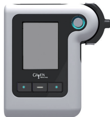
Fig. 2. External real-time image viewer.