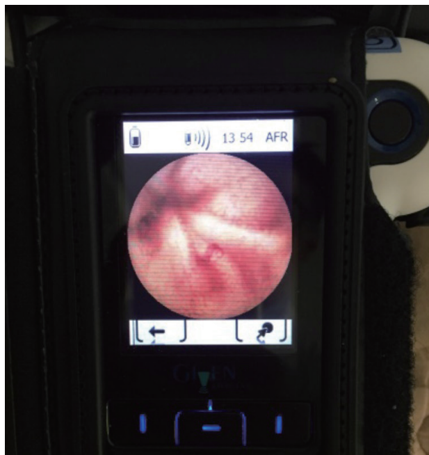
Fig. 3. External real-time image viewer indicating active small bowel bleeding.