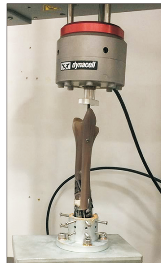
Figure 2. Testing machine to apply repetitive load to sawbone model.

After performing all tests, statistical analysis was done. For comparison of fatigue endurance of all screws, Kruskal-Wallis H test was performed. And Tukey's method for post