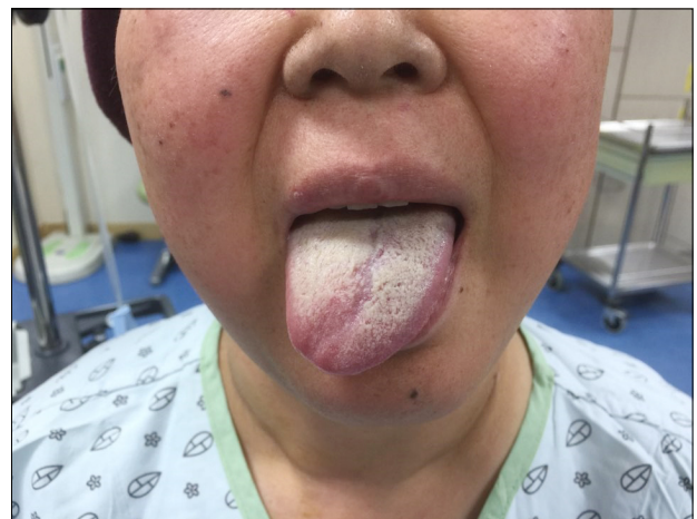
Fig. 2. Mobile tongue deviation to the right side.