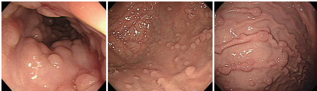
Fig. 3. Fundic gland polyps. The patient with familial adenomatous polyposis is frequently accompanied by multiple fundic gland polyps in the body and fundus of the stomach.

the fundus or body mucosa which secrete gastric acid. Adjacent mucosa is usually clear without inflammation or H. pylori infection.