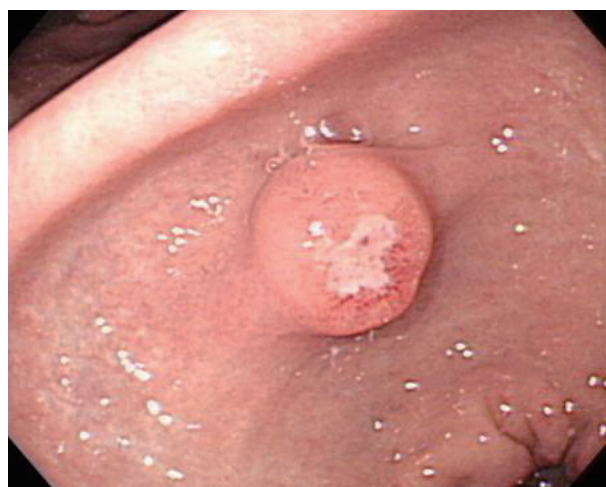
Fig. 2. Inflammatory fibroid polyp. The endoscopic shape of the lesion shows well-circumscribed, solitary, hemispherical mass with central ulceration.

Vanek 9 first described this lesion as gastric submucosal granuloma with eosinophilic infiltration in 1949. Histologically, this lesion shows proliferated spindle cells, abundant small blood vessels, and infiltration of inflammatory cells, especially dominated by eosinophils. Inflammatory fibroid polyp can be