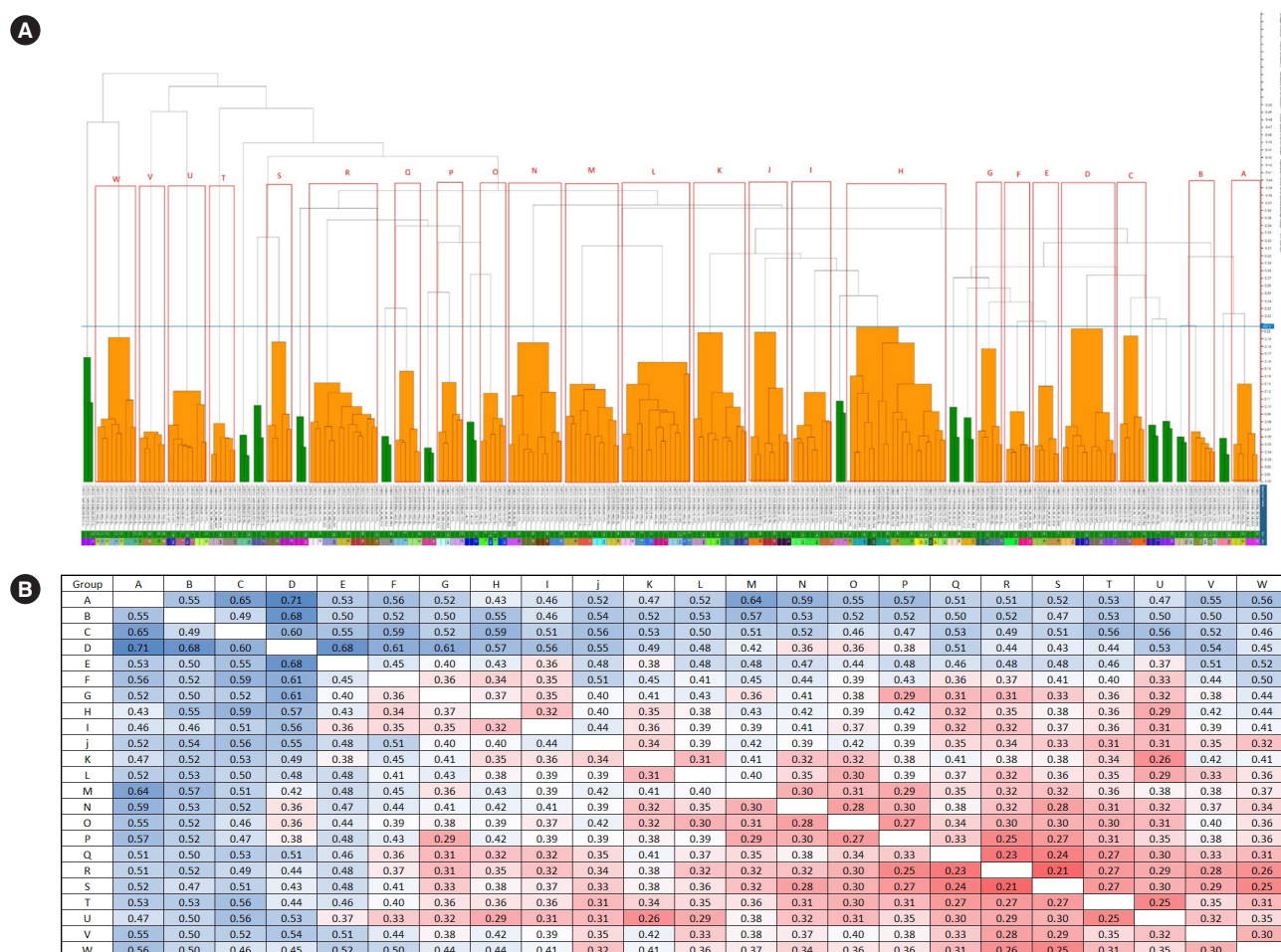
Fig. 3. Dendrogram and distance matrix obtained by IR Biotyper. (A) Eighty-three strains were classified into 23 groups (A–W); groups S and R were the most similar with a cut-off value (COV) of 0.21 (blue line), whereas groups A and D were the least similar as independent groups with a COV of 0.71. Green indicates a good-quality cluster and orange indicates a poor-quality cluster based on triplicate analyses of each isolate. (B) Distance matrix obtained by IR Biotyper. If the similarity between the two groups was less than 0.39, it was indicated in red, and if it was more than 0.39, it was indicated in blue.

IR Biotyper could accurately cluster Klebsiella pneumoniae strains, and typing results were almost completely concordant with those from PFGE and WGS [7]. Considering its advantages such as low cost and short turnaround time (<3 hours), IR Biotyper could be a promising tool for strain typing that could make real-time outbreak investigation a reality [7].