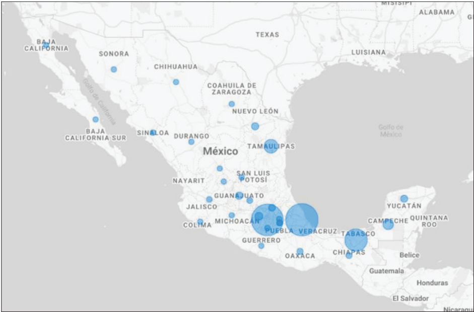
Figure 2. Map of Mexico showing the geographic distribution of requests for attention through the remote health program.