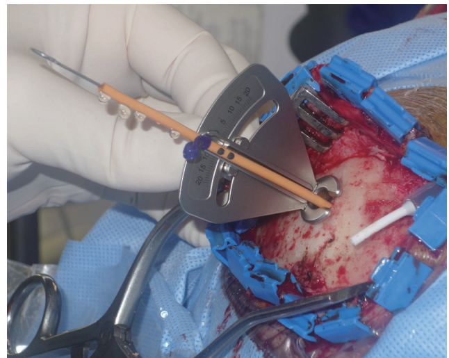
Fig 3. Intraoperative photograph showing the adjustable Ghajar guide used for the ventriculoperitoneal shunt.

Between October 2014 and December 2015, the adjustable Ghajar guide technique was applied to 20 patients and prospective data collected on the operative procedures (adjusted angle of catheterization from orthogonal trajectory, number of catheter passes) and postoperative CT. Based on the post-