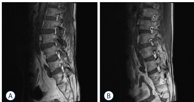
Fig. 2. T1-weighted sagittal image of a 44-year-old man with left lower extremity pain. A : Sagittal MR image shows Grade 3 foraminal stenosis at left foramen of the L3–L4 level. B : Sagittal MR image shows Grade 0 of normal neuroforamen at right foramen of the L3–L4 level. MR : magnetic resonance.

A total of 101 levels (202 neuroforamens) in 99 patients, where unilateral lumbar foraminotomy was performed (foraminotomy was performed at two levels in two patients), were analyzed through a combination of both T1- and T2-weighted sagittal images. Symptomatic neuroforamen (operated neuroforamen) and asymptomatic neuroforamen (non-operated neuroforamen) in each level were evaluated.