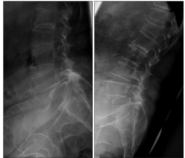
Fig. 1. Dynamic radiographs show spondylolisthesis at L5 on S1.

(Table 1). Our patient did not have any predisposing risk factors for pedicle fractures except severe osteoporosis. Osteoporotic bone loss resulting in material and structural changes of the bone leads to an increased risk of stress fractures due to the weakened structure of the spinal bones. Tabrizi and Bouchard 10 reported axial osteoporosis caused stress fractures of the pedicles and produce a spondylolisthesis in the 73-year old female patient. Stress fractures can develop after minor trauma or even in