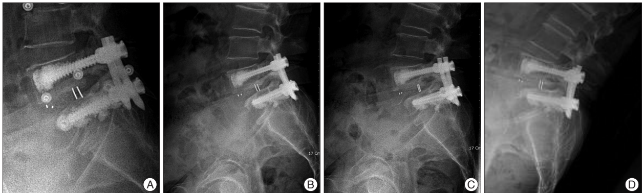
Fig. 3. Postoperative simple lateral radiographs of the patient over 12 months period. A : Immediate postoperative lateral radiograph. B : At 3 months after operation. C and D : Dynamic radiographs (flexion and extension) reveal of the L4 pedicle at 12 months after operation.