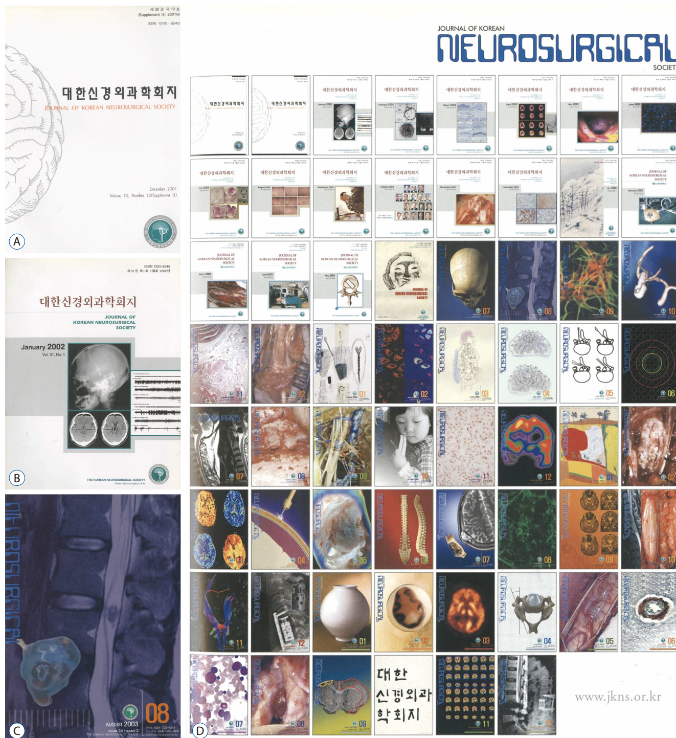
Fig. 2. Changes of cover of the Journal of Korean Neurosurgical Society . Cover of the journal before change (A), new cover design with illustration since 2002 (B), cover with full-size illustrations (C) since 2003. D shows assorted covers in one page.

since 2003 (Fig. 2). Editing of the articles was also modified. With more compact editing and adjustment of size of illustrations and tables, the pages per articles were reduced, with enhanced readability. Commercials from medical devices and