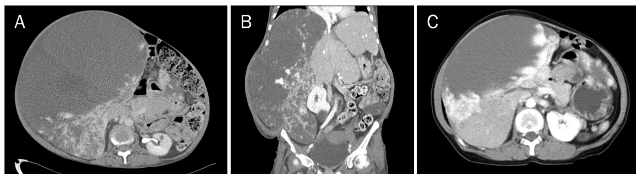
Fig. 2. Abdominal CT scan at presentation with several centripetal enhancing exophytic masses in both hepatic lobes (maximum size, 32.3×27.5×25.4 cm). (A) Cross section image. (B) Coronal section image. (C) Cross section image of abdominal CT 8 years prior (maximal size, 22.3 cm).