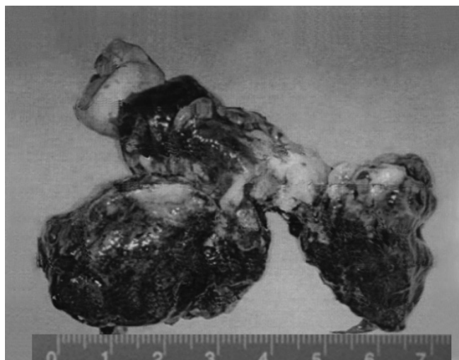
Fig. 2. Intraoperative finding. A friable right ovarian mass measuring 7 cm in its greatest diameter was found during Cesarean section.