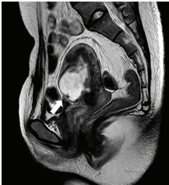
Fig. 2. Pelvis magnetic resonance imaging image shows severe thinning of uterine wall at the anterior lower segment (arrow).

serum hemoglobin and \beta -hCG were 13.3 g/dL and 152,760 mIU/mL, respectively. Transvaginal ultrasound showed thinning of uterine myometrium which was estimated about 3.3 mm on the axial view (Fig. 1A). Well-defined gestational sac contained a fetal pole with normal heart beat (Fig. 1B). Crown lump length was checked about 1.94 cm which was appropriate for 8+4 weeks' gestation. The images of pelvis magnetic resonance imaging (MRI) showed