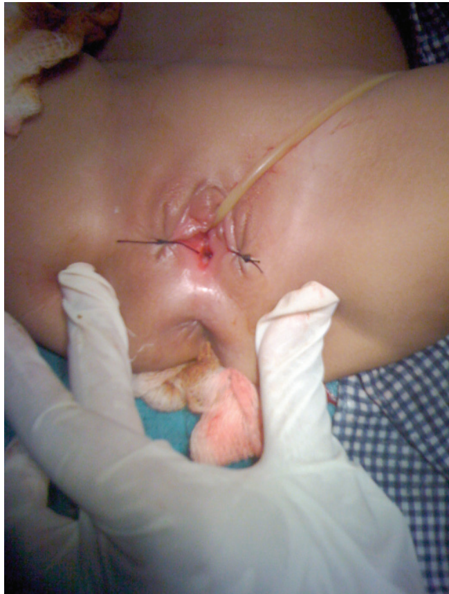
Fig. 2. Photograph of perineum showing vaginal orifice after resection of septum and drainage of pyometra.

men or distal vaginal atresia present with recurrent urinary tract infection, abdominal mass and sometimes findings of obstructive uropathy during the neonatal period as seen in our case but the condition often go unrecognised until weeks or months later when they develop the above three hallmarks of the condition. True incidence of these anomalies is unknown but is reported to be between 0.1% and 3.8% [4]. The incidence of hydrometrocolpos is 1 in 16,000 live births [5]. The rarity of this anomaly quoted in the earlier literature was probably due to difficulty in diagnosis and high mortality rates resulting from infections and associated anomalies even before the diagnosis could be established. Complication of pyometocolpos requiring urgent attention among both infants and adolescents is acute urinary retention. Rarely, an infant may have respiratory insufficiency or inferior vena cava compression because of the large mass. Endometriosis can be a late complication due to retrograde blood flow especially in patients with high transverse vaginal septum [1]. Diagnosis can be challenging. Initial studies should include a USG of the abdomen and pelvis. MRI can also be useful to depict pelvic anatomy