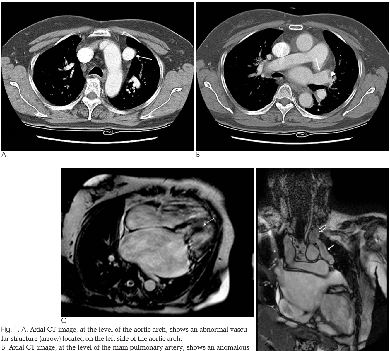
Fig. 1. A. Axial CT image, at the level of the aortic arch, shows an abnormal vascular structure (arrow) located on the left side of the aortic arch. B. Axial CT image, at the level of the main pulmonary artery, shows an anomalous vein (arrow) located between the left pulmonary artery and the left bronchus. The left superior pulmonary vein (arrowhead) drains into this anomalous vein. C. Four-chamber cine MR image shows the giant left atrium and tight mitral stenosis with dark jet flow (dotted arrow). D. A MR coronal image shows the course of the levoatriocardinal vein (arrow), which is connected to the left innominate vein (open arrow).

For further evaluation of the shunt via partial anomalous pulmonary venous return, MRI was performed. Cardiac MR was performed using the Gyroscan Intera 1.5 T scanner (Philips Medical Systems, Best, The Netherlands). Balanced turbo field echo (TFE) images of the thorax were obtained from the aortic arch to the car-